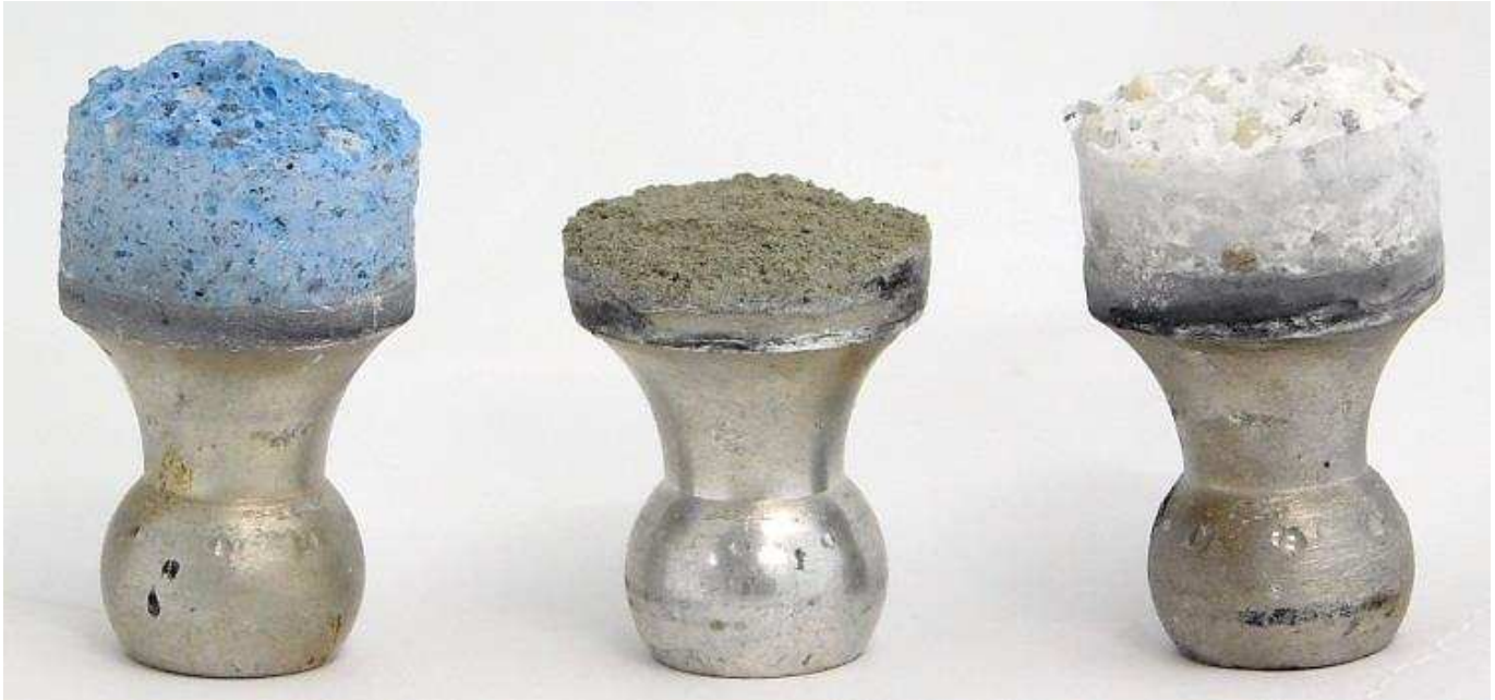
Blue swimming pool plaster