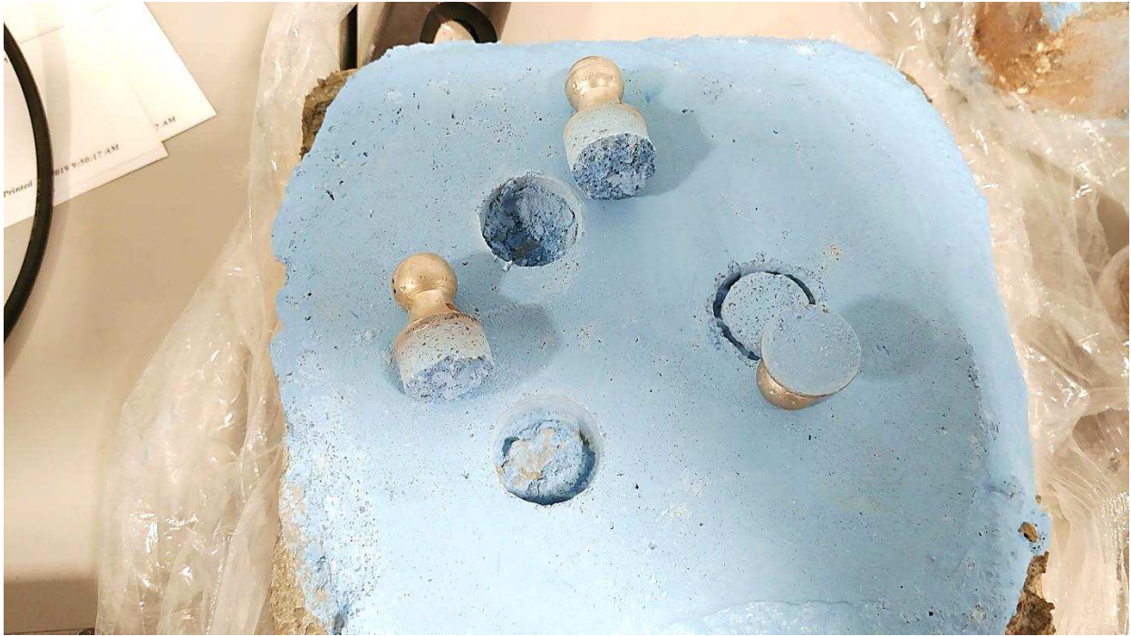
BC WP Mod Plaster (blue) - See above