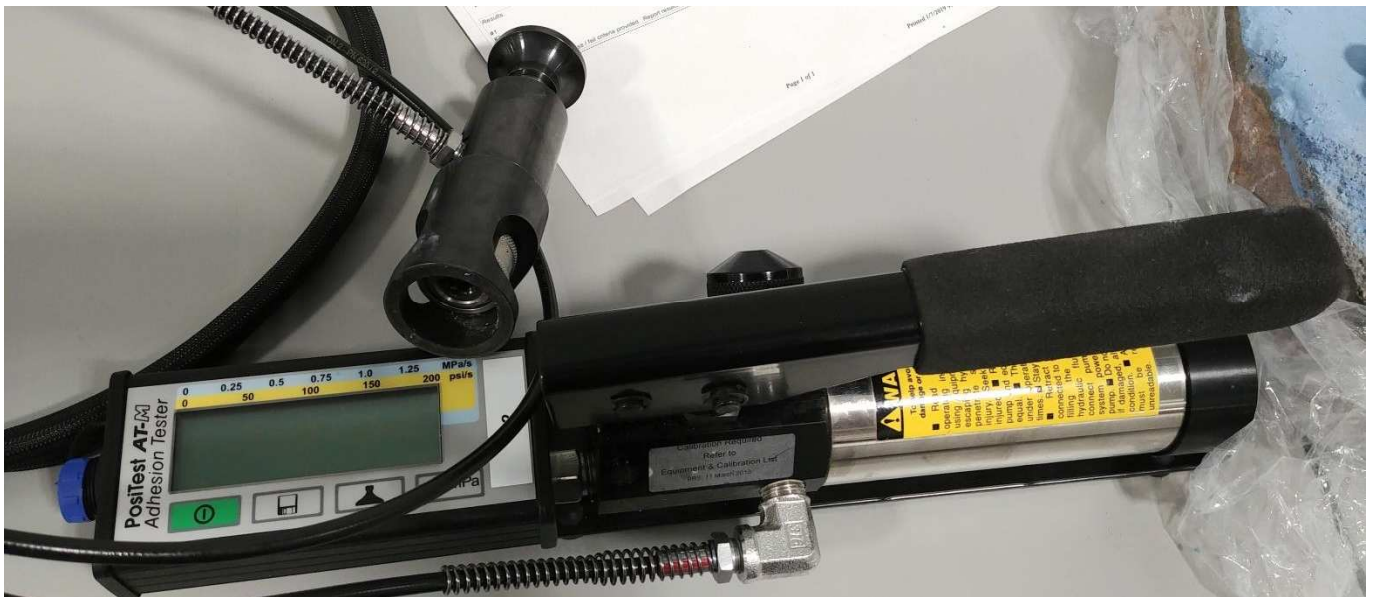
Pull-off Adhesion Testing Device