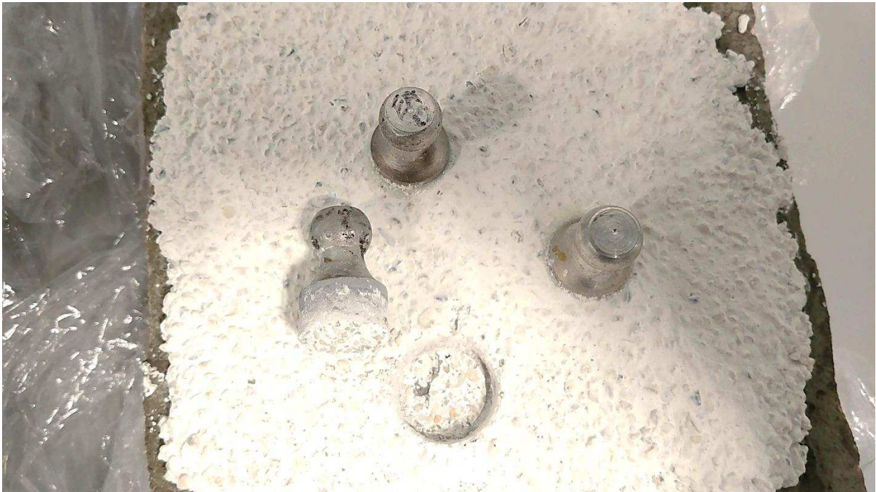
BC WP Mod Plaster (white) - See above